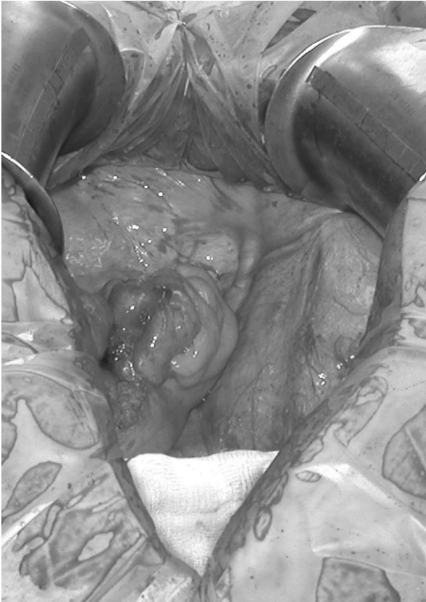
Figure 2. THE EZ DASH in use at the start of a low anterior resection. The patient has had a prior colostomy and preoperative irradiation. The EZ DASH device (white) is tucked up beneath the upper abdominal wall and prevents the small bowel from entering the field.

resections, abdomino-perineal resections, J-pouch revision-reconstructions, etc), 63 total or supracervical hysterectomies, 13 major upper abdominal procedures, ie, Whipple procedures or liver resections, and in 2 cases each of anterior spine access, thoracic and vascular surgery, as well as in assorted other procedures.